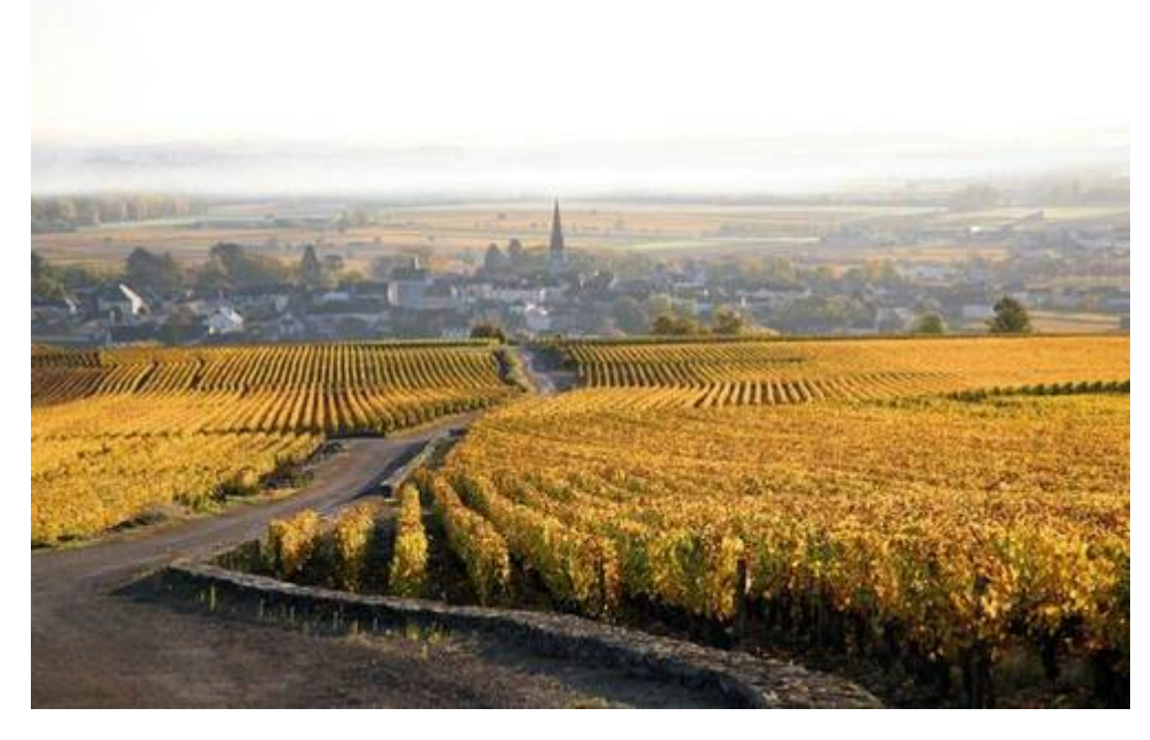
Day 8 - PULIGNY MONTRACHET. Tour ends after breakfast. Transfer by taxi to the Beaune rail station.

Day 7 - MEURSAULT - PULIGNY MONTRACHET. (16 or 21 km) Making your way across the vineyards, you will arrive in the hamlets of Blagny and Gamay, and then pass through the forest that stretches across the heights of the Côte de Beaune. You will arrive in La Rochepot, a village that boasts of having one of the most beautiful châteaux Burgundy, this one dating to the 15th century. You will descend into the village of Saint Aubin and its 10th century church. Crossing through the Grands Crus Chassagne-Montrachet and Puligny-Montrachet, you will arrive in the village of Puligny-Montrachet where you will spend the night in a lovely Burgundian home - Dinner, lodging and breakfast in a 4-star hotel