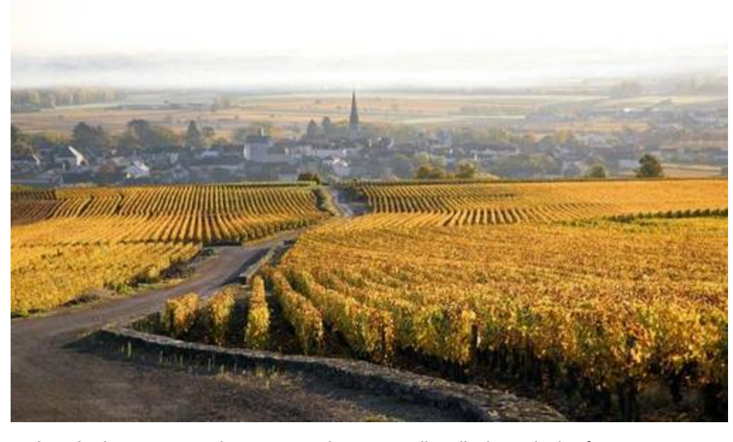
Day 6 - BEAUNE – MEURSAULT (15 or 20 km). You will leave

Day 5 - Visit of BEAUNE - A day's visit of this city is easily justified. manifold Explore the buildings, stroll through the narrow streets lined with beautiful homes, some of them dating back to the Renaissance period. Sites of intrigue are the Hôtel-Dieu, the Collegiale Notre Dame, and the Musée des Vins de Bourgogne, found in the old Hôtel des Ducs de Bourgogne. Of course, you may choose to spend your entire day in the different wine cellars of the city, enjoying the variety of the regional wines! Lodging and breakfast in the same hotel